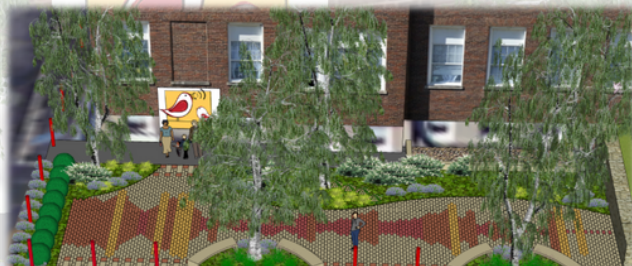
THE SOUND BEGINNING GARDEN FACES MENEFEE DR NEXT TO THE ELC ENTRANCE †

The Sound Beginning Garden surrounds a unique pathway that reflects our slogan, "a sound beginning", in a sound wave pattern created by bricks! It's such a uniquely artistic way to reflect our impact and purpose.